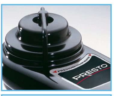
Pressure regulator/ steam release system ensures precision cooking.