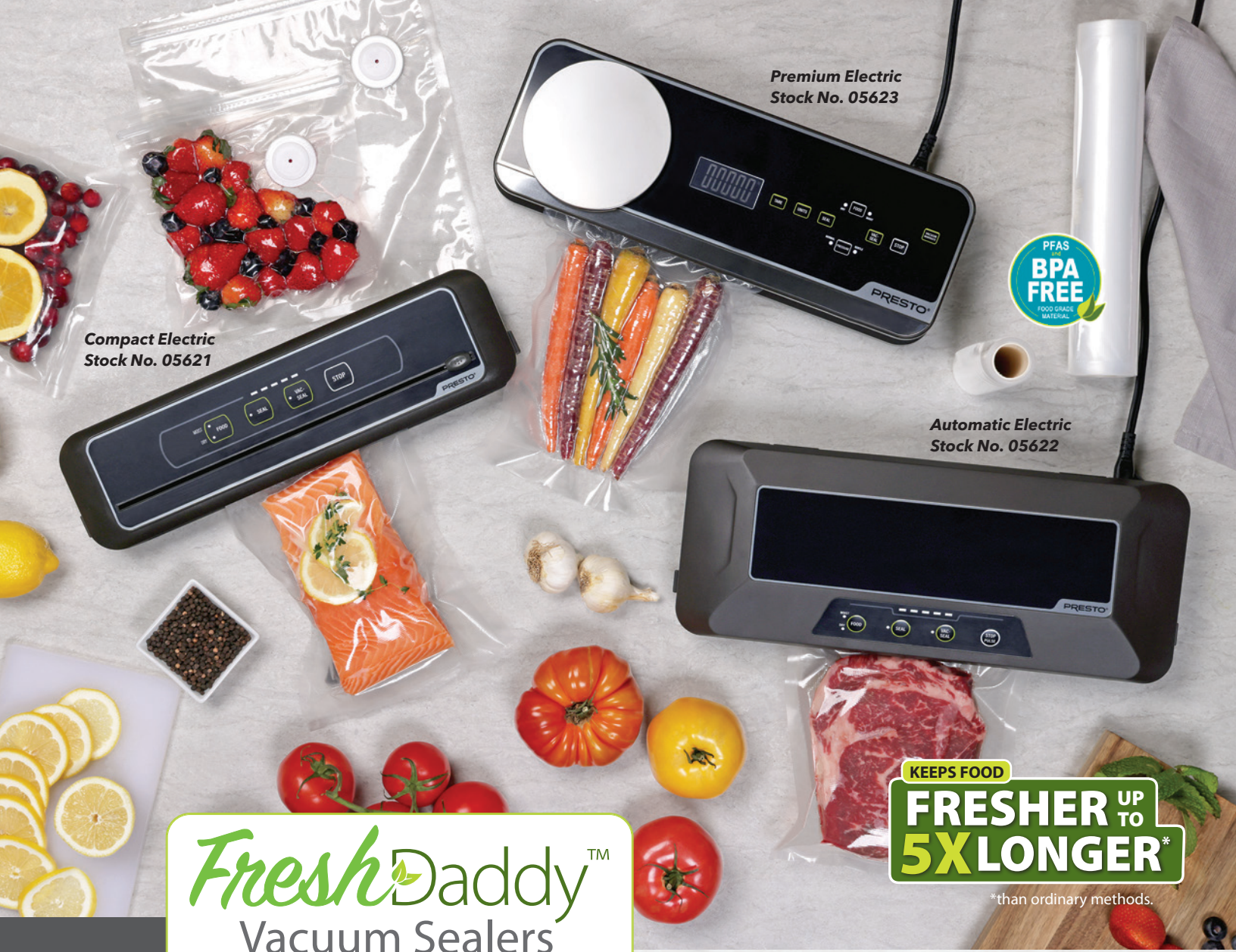
Premium Electric Stock No. 05623