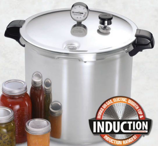
23-quart induction compatible Pressure Canner with stainless steel-clad base Liquid capacity: 23 quarts (21.8 liters) Stock No. 01784

Full-sized Presto® pressure canner that works on an induction range!