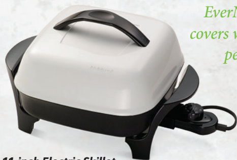
11-inch Electric Skillet 120 volts AC, 1000 watts Stock No. 06620

EverNu™ high dome covers won't dent, warp, peel, or bend.