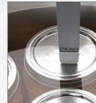
One-inch water measure