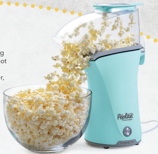
PopLite® Plus hot air popper 120 volts AC, 1470 watts Stock No. 04867

“My munch® is not only great for popping just the right amount of popcorn, it's also amazingly easy to store.”