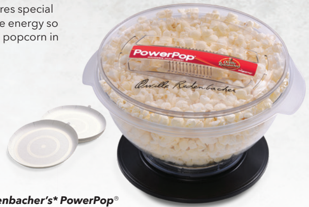
Orville Redenbacher's* PowerPop® microwave multi-popper by Presto Stock No. 04830