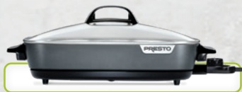
16-inch Electric Slimline™ Skillet with glass cover 120 volts AC, 1500 watts Stock No. 06858

The low-profile design of the Slimline™ Skillet is ideal for buffet serving. Saves on storage space too!