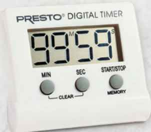
Electronic Digital Timer Stock No. 04213

Timer shows minutes and seconds with an easy-to-read digital display. Counts down from any time up to 99 minutes and 59 seconds with an alarm that signals when time is up.