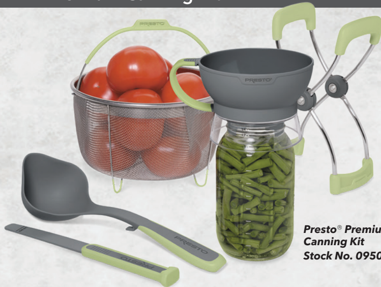
Presto® Premium Canning Kit Stock No. 09509

This 8-function set includes a deluxe canning funnel with inner and outer collars to keep jar rims and counters clean! The funnel fits on both regular and wide mouth jars.