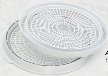
Add-on Nesting Trays Sold in sets of two