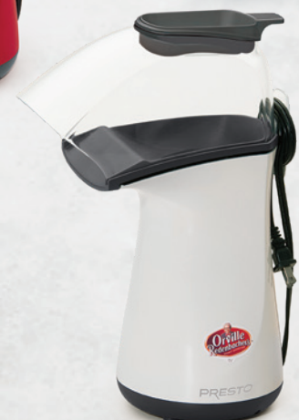
Orville Redenbacher's* Hot Air Popper by Presto 120 volts AC, 1475 watts Stock No. 04821