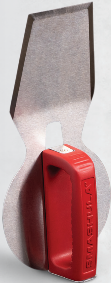
Smashula™ Stainless Steel Burger Press and Spatula Stock No. 09516