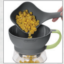
Canning funnel and wide scoop ladle

Maximize efficiency and have the best accessories at your fingertips for successful canning!