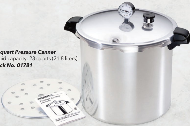
23-quart Pressure Canner Liquid capacity: 23 quarts (21.8 liters) Stock No. 01781

Full-sized Presto® pressure canner that works on an induction range!