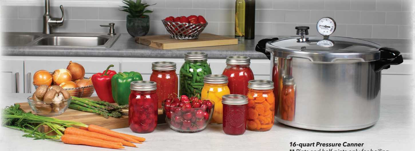
16-quart Pressure Canner ** Pints and half-pints only for boiling water method. Liquid capacity: 16 quarts (15.1 liters) Stock No. 01755