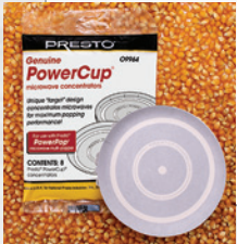
Genuine PowerCup® microwave concentrators 1 bag (8 concentrator cups) Stock No. 09964