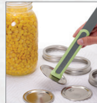
Magnetic lid lifter