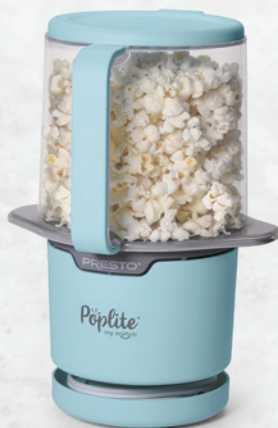
PopLite® my munch® hot air popper 120 volts AC, 970 watts Stock No. 04811

Personal-size PopLite® my munch® hot air popper is great for snacking and portion control . It pops up to 8 cups in about 2 minutes with virtually no unpopped kernels.