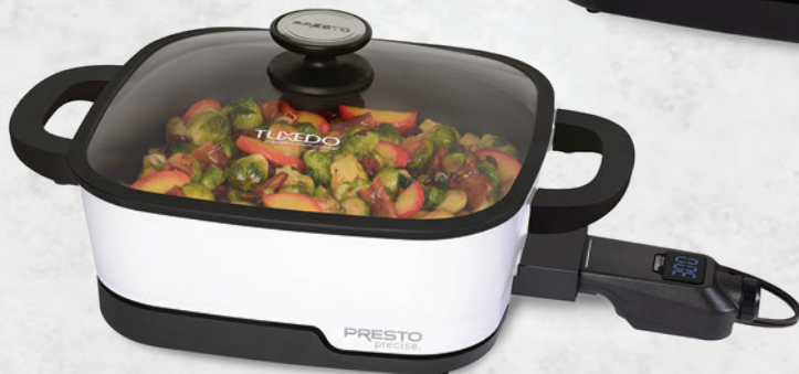
Tuxedo® digital precision skillet multi-cooker 12-inch size 120 volts AC, 1100 watts Stock No. 07118

Digital Heat Control with large LED display for precise heat regulation.