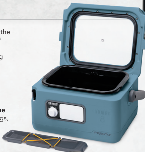
8-quart Nomad ® Traveling Slow Cooker 120 volts AC Stock No. 06017 (Blue)

Swing up handle and detachable utensil holder.