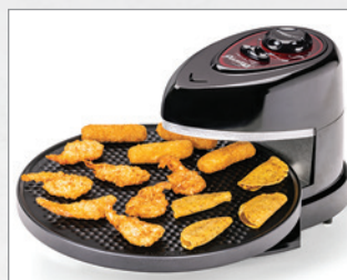
Pizzazz ® Plus rotating pizza oven 120 volts AC, 1235 watts Stock No. 03430