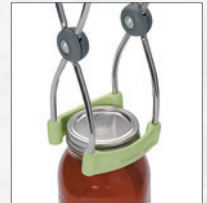
Spring-loaded jar lifter