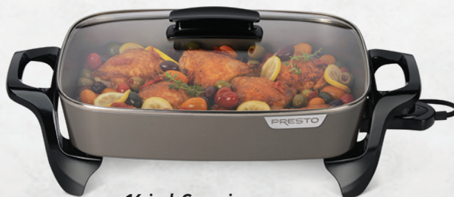
16-inch Ceramic Electric Skillet 120 volts AC, 1500 watts Stock No. 06856

Healthy CERAMIC NONSTICK SURFACE PFAS FREE