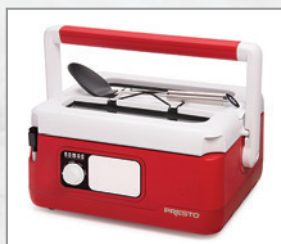
6-quart Nomad ® Traveling Slow Cooker 120 volts AC Stock No. 06011 (Red)

Swing up handle and detachable utensil holder.