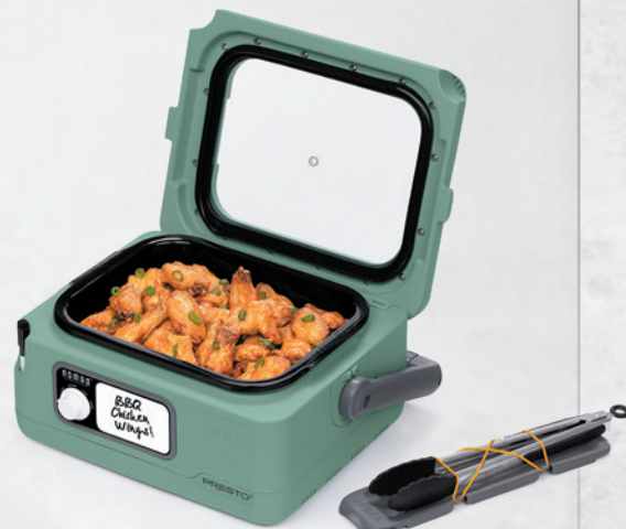
6-quart Nomad ® Traveling Slow Cooker 120 volts AC Stock No. 06016 (Green)