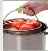
Stainless steel blanching basket