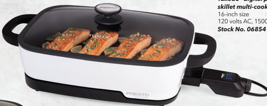
Tuxedo® digital precision skillet multi-cooker 16-inch size 120 volts AC, 1500 watts Stock No. 06854

Healthy CERAMIC NONSTICK SURFACE PFAS FREE