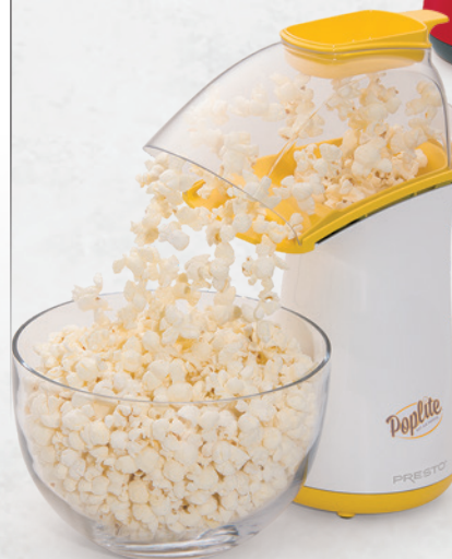
PopLite® hot air popper 120 volts AC, 1475 watts Stock No. 04820 (Yellow) Stock No. 04863 (Red) Stock No. 04869 (Aqua)