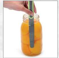
Bubble remover multi-tool

Maximize efficiency and have the best accessories at your fingertips for successful canning!