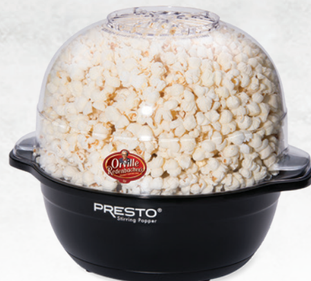
Orville Redenbacher's* Stirring Popper by Presto 120 volts AC, 900 watts Stock No. 05204

Healthy CERAMIC NONSTICK SURFACE PFAS FREE