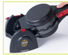
Close cover, flip, and cook.