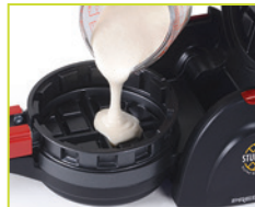
Pour in batter.