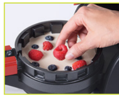
Add stuffing and more batter.